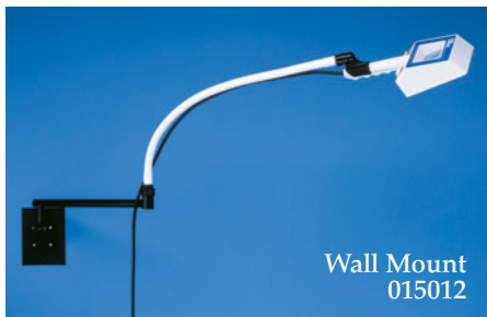
Wall Mount 015012

Diagnostic Magnifying (Woods) Light For A Variety Of Uses